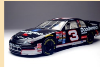
PHOTOGRAPHY FOR AJB OUTDOORS WORKING WITH DALE EARNHARDT, INC.