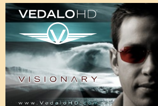
PRINT AD FOR VEDALO HD